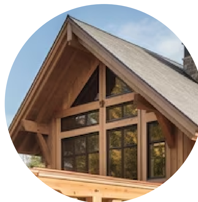
FACADE AND WINDOW TIMBER (SIMILAR)