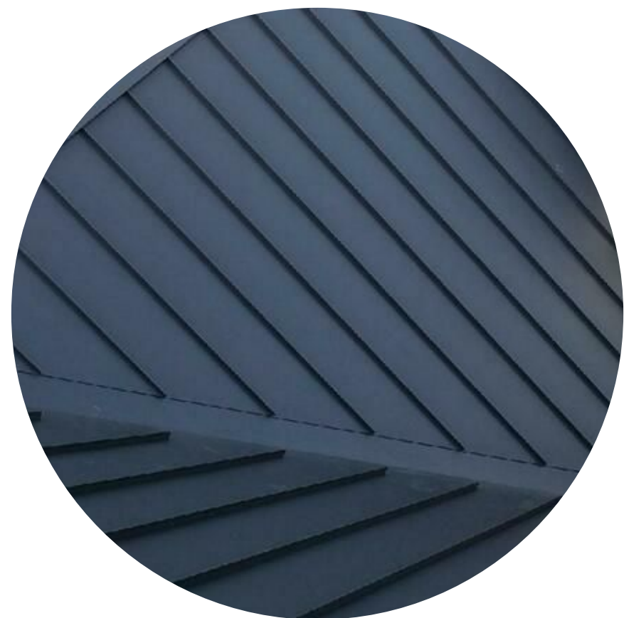
STANDING SEAM METAL ROOFING