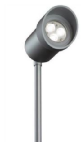
PEDESTRIAN/ GREEN SPACE LIGHTING 3W SOLAR OR EQ.