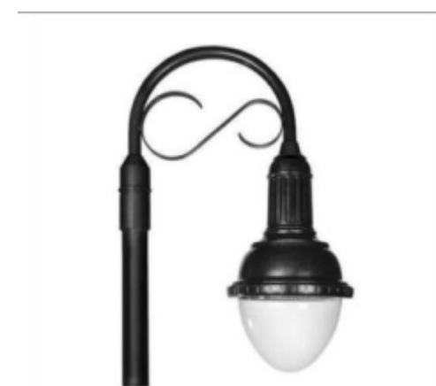
PARKING LOT LIGHTING, DOWN LIGHTING OR EQ.