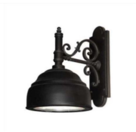
UNIT ENTRY DOOR LIGHTING, OR EQ.