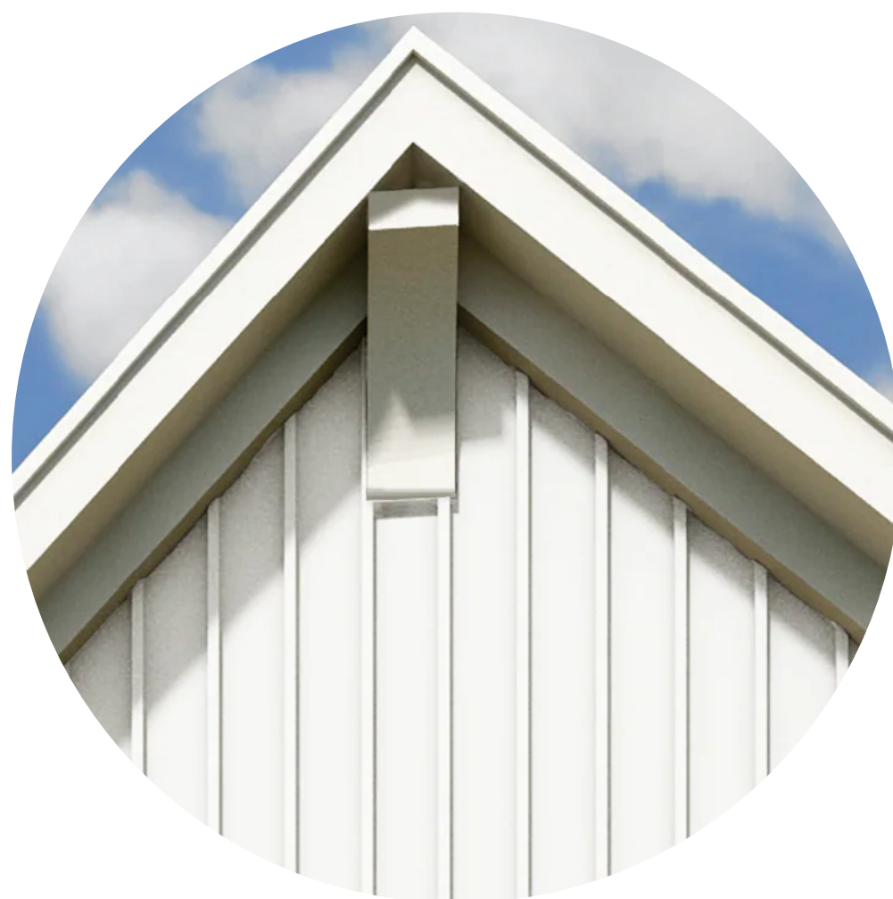
VINYL BOARD AND BATTEN SIDING